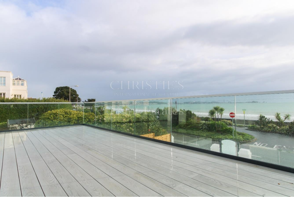
Short walk to restaurants, bars and shops