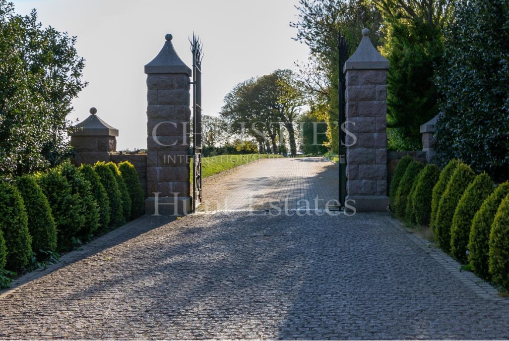
“Gated entrance and long tree lined driveway”