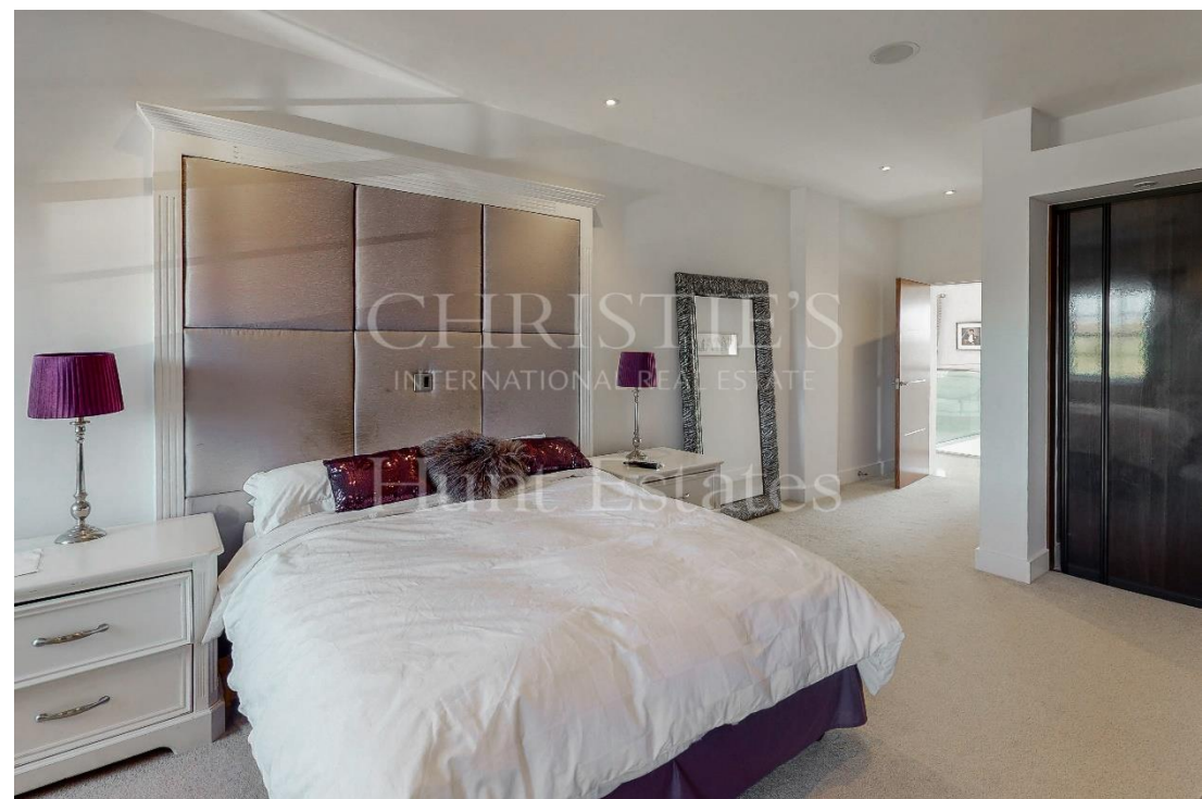
“One of three additional bedroom suites, all with walk in wardrobes and en-suite bathrooms”