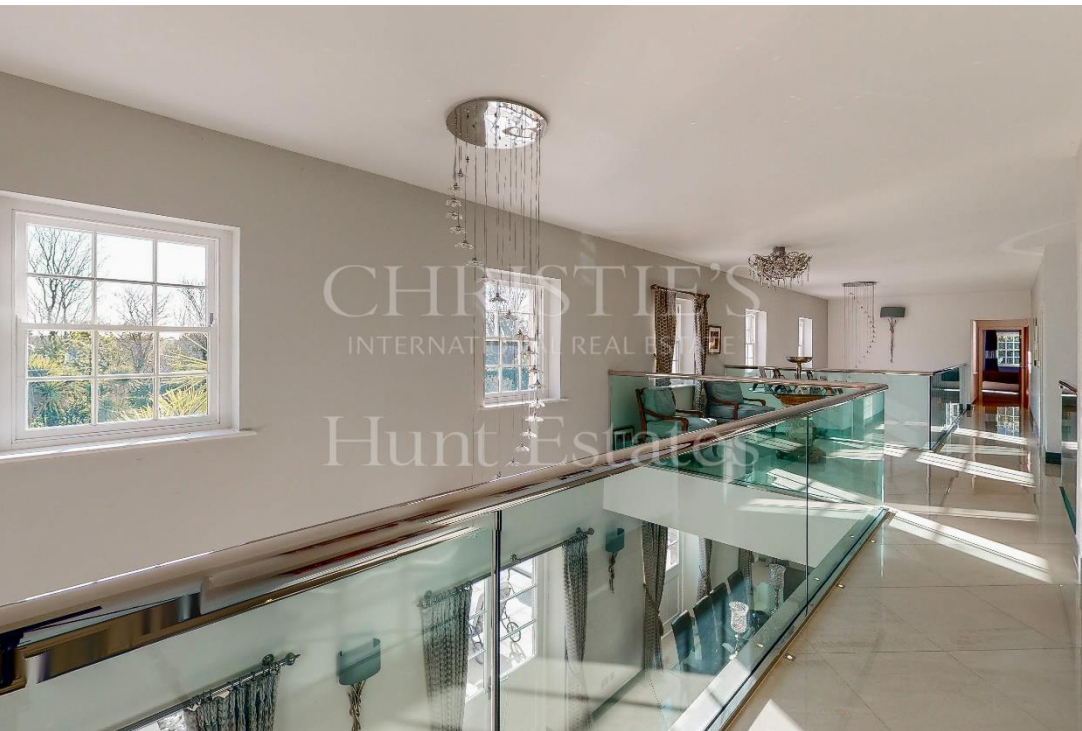
“The first-floor landing with seating area and overlooking the living room below. ”