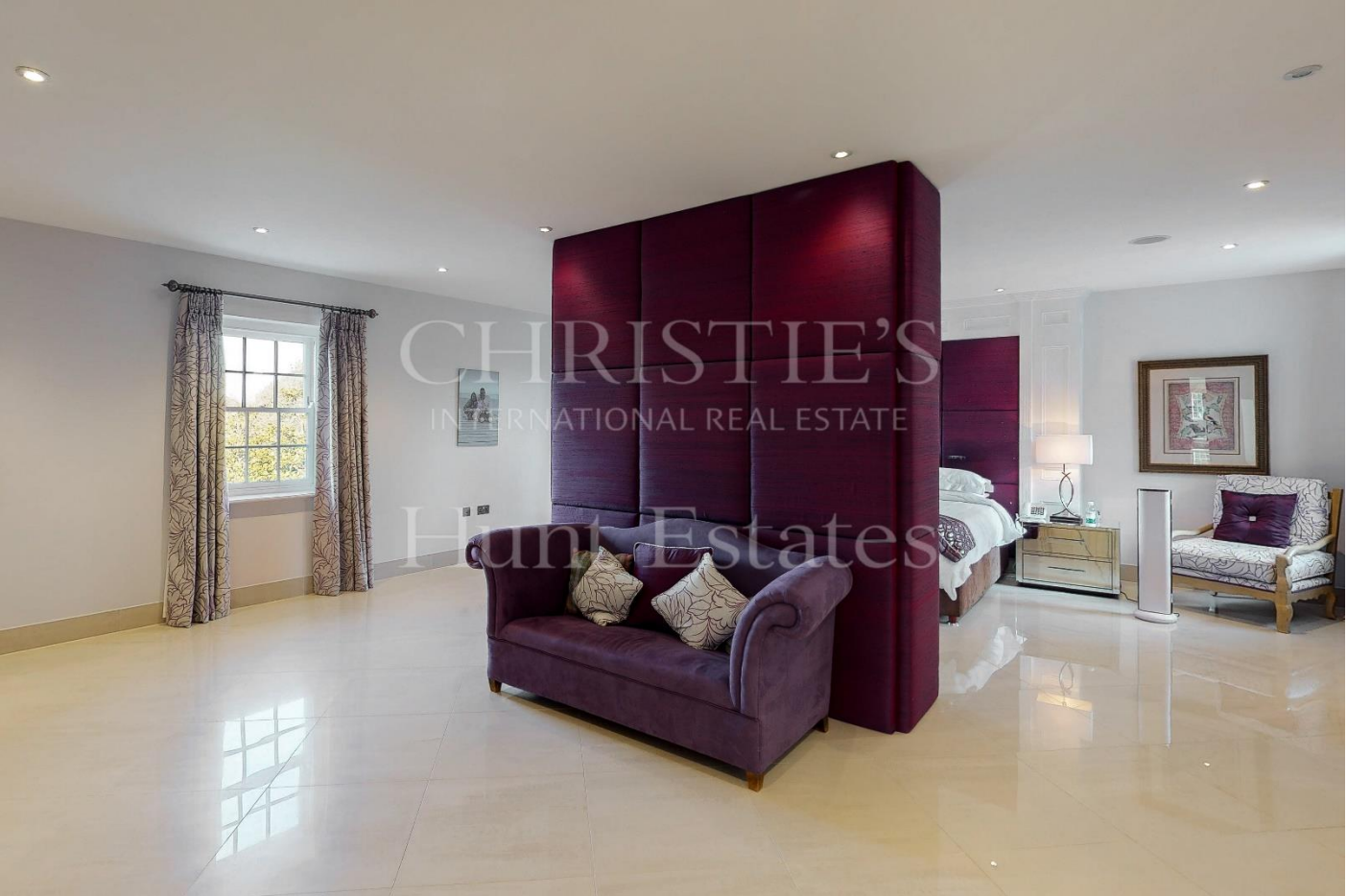
“Spacious main bedroom suite with dressing room, en-suite bathroom and additional storage”