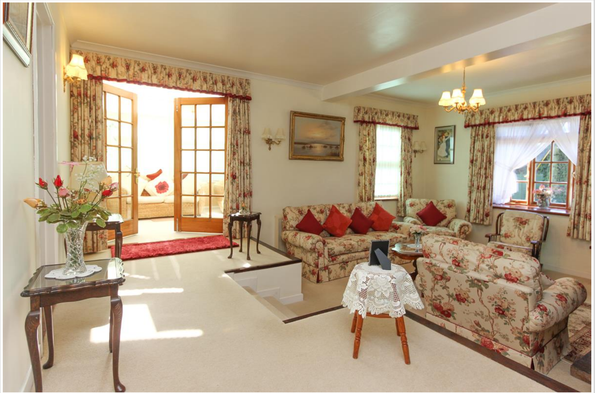
Situated on a quite country lane in St Ouen, this 1980's 3 bedroom property really is something quite special.