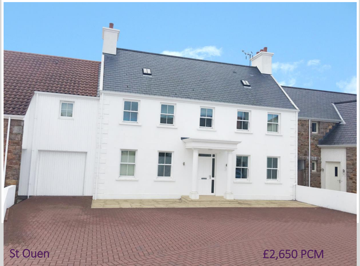
Four bed detached property near to St Ouen's Village