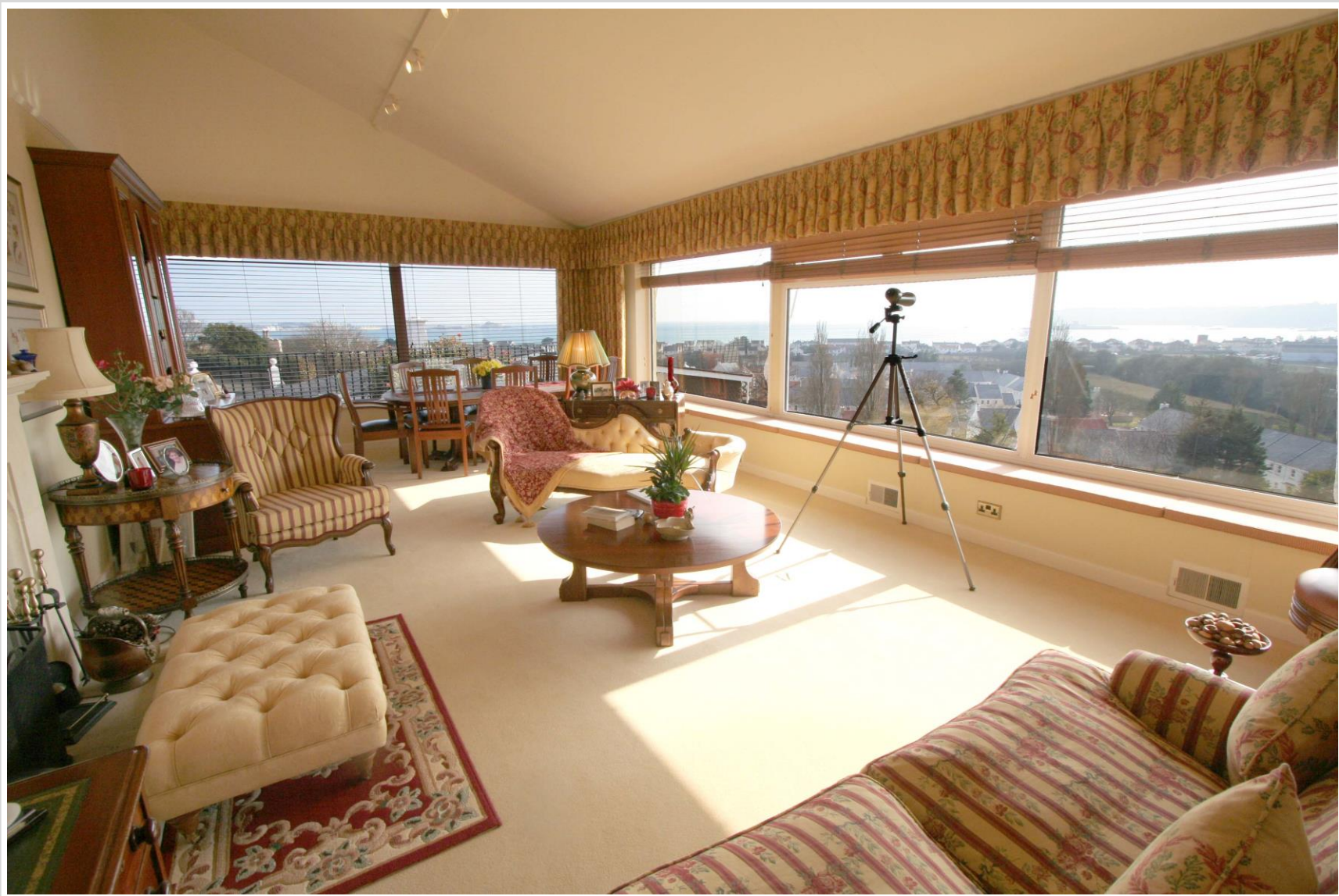
Located at the end of quiet private road in an elevated position with breath-taking views over the south coast from Elizabeth Castle to St Aubin's Fort.